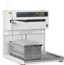
Fraction collector C-660 Fraction collection