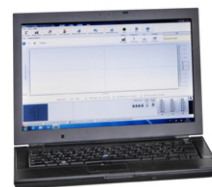
SepacoreControl Software Full control software