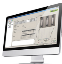
Melting Point Monitor Software Data management software