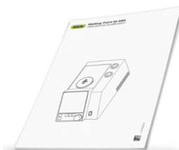
IQ / OQ for M-565 Qualification procedures