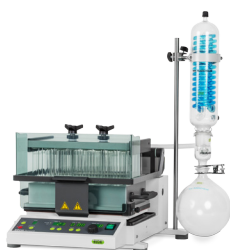
Syncore® Polyvap Multiple sample workup