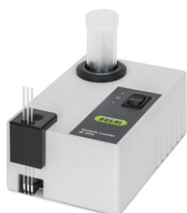
Sample Loader M-569 Efficient packing of capillaries